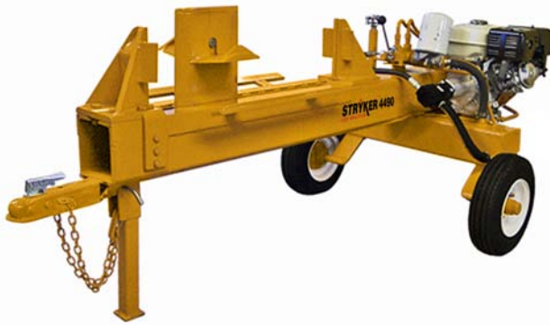
AVAILABLE OPTIONS: Log Lifter, 30", 36" or 48" Stroke

The heavy-duty design of the 4490HT keeps everyone happy. If you're producing 40 face cords per day, 5 days a week, this may be the one to look at. Comes equipped with both the two and four-way blades, which can be interchanged in less than 15 seconds.