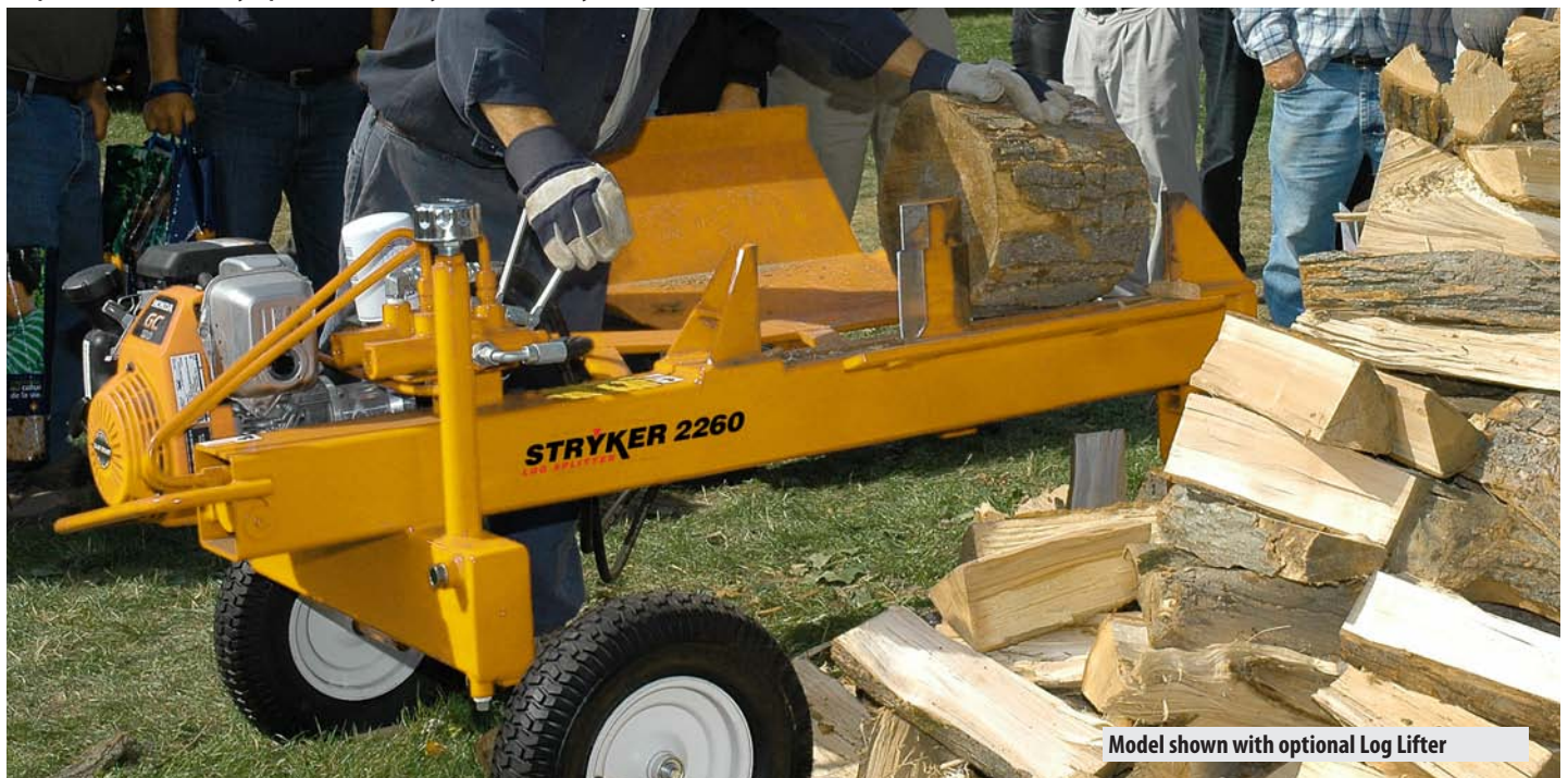
Model shown with optional Log Lifter

Durable...easy to operate...and a very efficient design. STRYKER log splitters are highway towable and have been proven as the preferred log splitter because they operate for many trouble-free years.