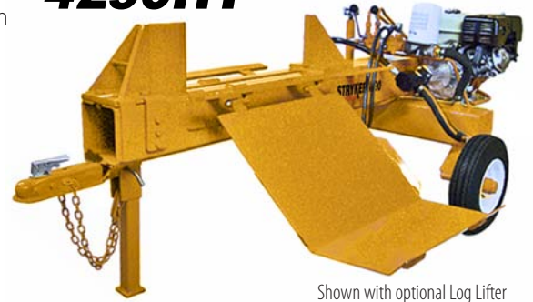
Shown with optional Log Lifter

AVAILABLE OPTIONS: Log Lifter, 3" Knife Extension, 30", 36" or 48" Stroke